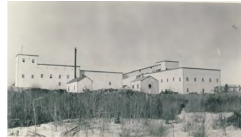
The Cochenour-Willans Gold Mines mill, 1940

South Bay Mines Starts Producing (copper and zinc)