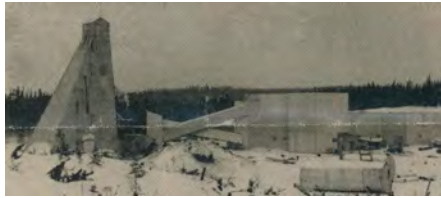
South Bay Mines, 1971