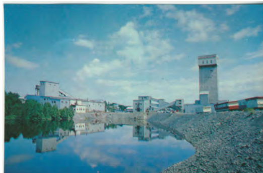
Madsen Red Lake Gold Mines