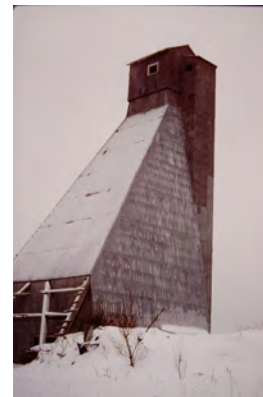
Mount Jamie Mines