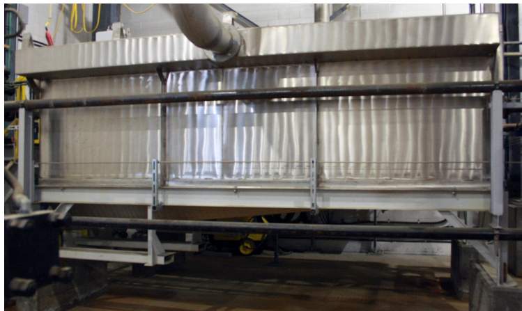
Exterior of the electrowinning tank

The gold collection can only happen after the electrowinning tank has cooled. The collected gold is referred to as precipitate and has a mud-like consistency. The precipitate goes through a press and is dried. The precipitate concentrate is collected and stored for the refining process.